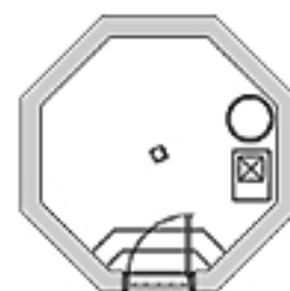
Pedestal Plan (100 sq. ft. or 9 m 2 )