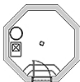
Pedestal Plan (100 sq. ft. or 9 m 2 )

Floor Plan (1,765 sq. ft. or 126 m 2 ) (Total 1,965 sq. ft. or 145 m 2 )