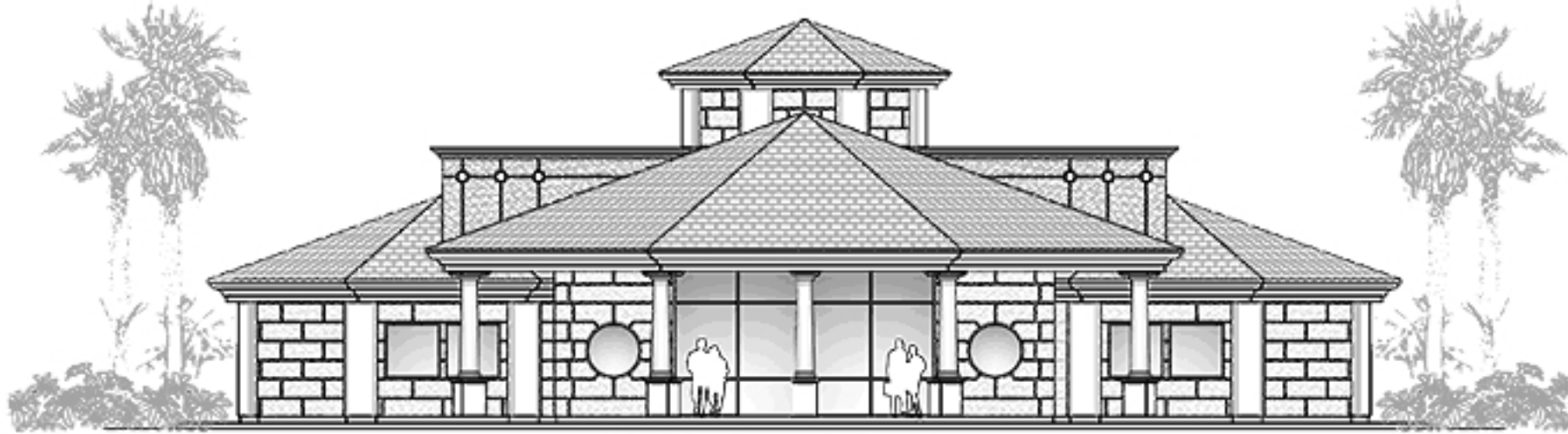
Lobby Level Elevation